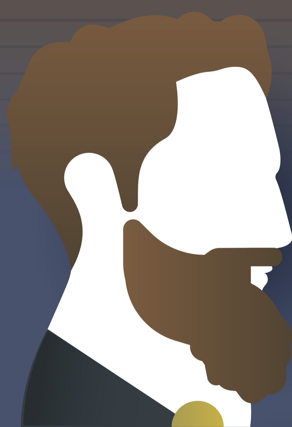
HERMAN MELVILLE 1819–91

The author of the epic novel Moby-Dick , Melville is regarded as one of the greatest American writers. He wrote "Bartleby the Scrivener" amid a storm of criticism from the literary world, and its themes of capitalism, absurdity, and protest have long intrigued readers.