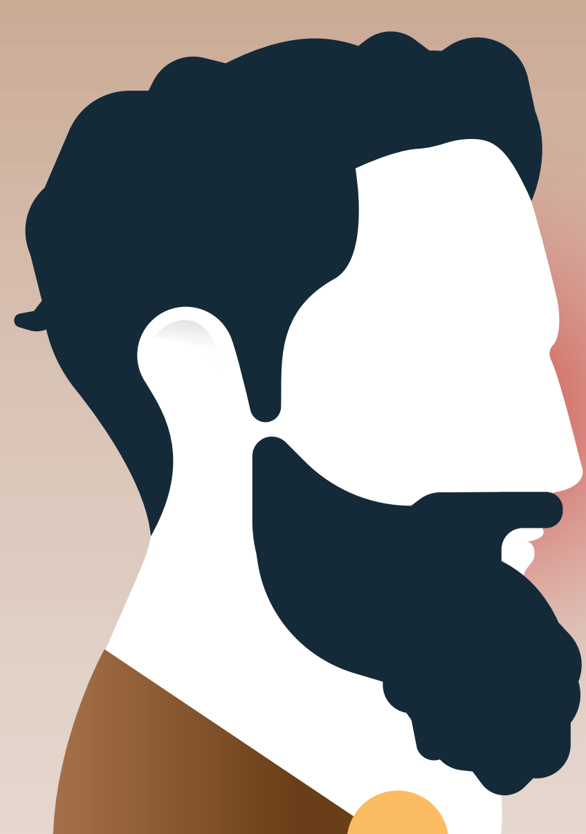
HERMAN MELVILLE 1819–91

Melville spent many years at sea, working on merchant vessels or whaling ships. As in Billy Budd, Sailor , his maritime experiences often informed his writing. His major works are stories of adventure, but they also often deal with profound issues of the human experience.