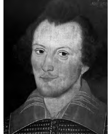
The Sanders portrait