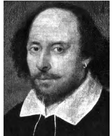
The Chandos portrait

The Droeshout portrait is the most recognizable and iconic image (and the inspiration for our animated Shakespeare!). It was an engraving made by Martin Droeshout not long after Shakespeare's death in 1616, to illustrate the First Folio of Shakespeare's work, published in 1622. It is thought to be an accurate likeness, as the people involved in the Folio – including Shakespeare's fellow playwright, Ben Jonson – knew him in life.