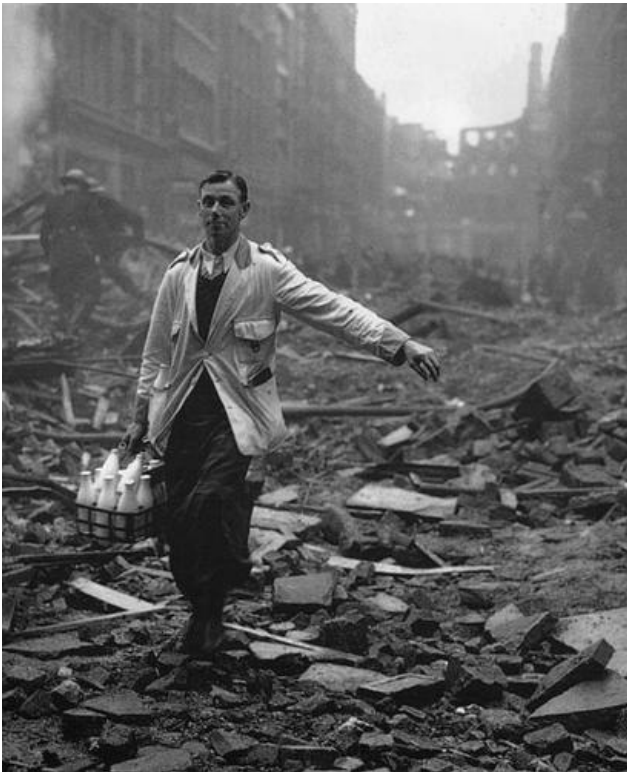
milkman in rubble during the Blitz