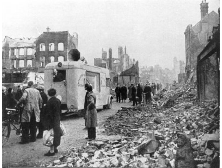
ambulance on High Street during the Blitz