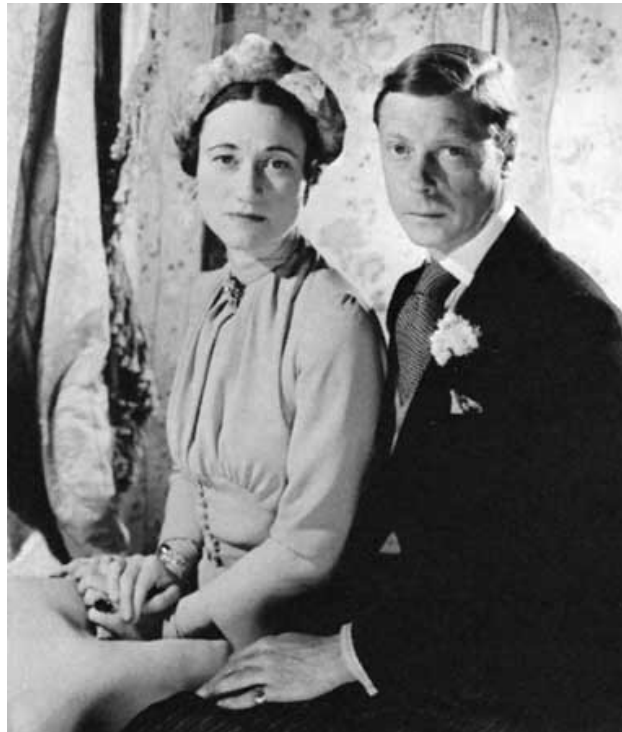
Wallis Simpson and Edward VIII on their wedding day

The monarch of the United Kingdom is supreme governor of the Church of England. At the time of the proposed marriage, and until 2002, the Church of England did not permit the re-marriage of divorced people with living ex-spouses. Therefore the constitutional position was that the King could not marry a divorcée and remain as King (for to do so would conflict with his role as Supreme Governor). Furthermore, the British government and the governments of the Dominion were against the idea of marriage between the King and an American divorcée for other reasons. She was perceived by many in the British Empire as a woman of "limitless ambition", who was pursuing the King because of his wealth and position.