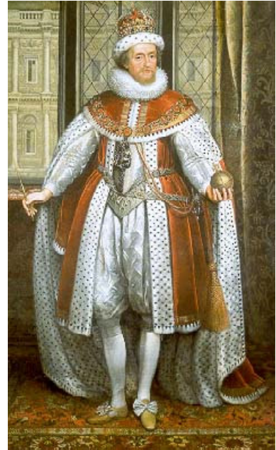
King James I