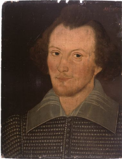
William Shakespeare (as painted by John Sanders)