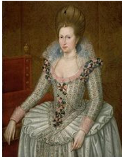
Anne of Denmark