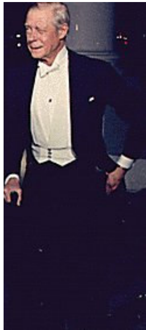
Edward VIII (circa 1970)