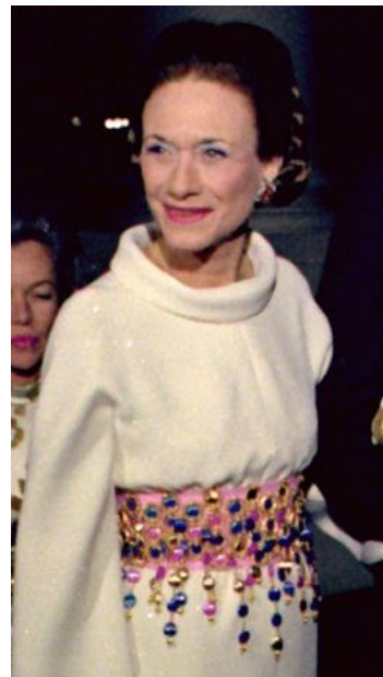
Wallis Simpson (circa 1970)