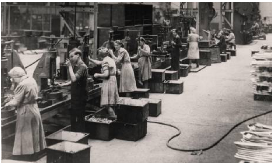
munitions factory in England

Costumes are mid-century. We have a sense of the real effects of war, with mud and blood – it's not pretty, but is a contrast to the sophistication of the castle scenes. We see those who devised the war versus those who carry it out.