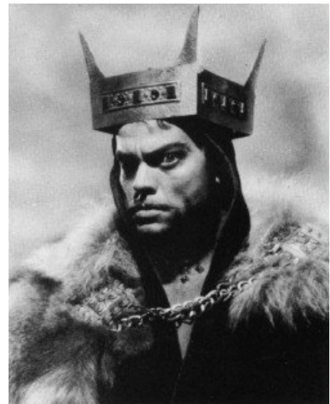
Orson Welles as Macbeth (1948)