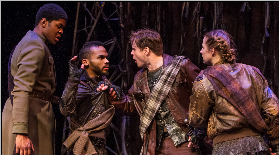
Siward, Malcolm, Macduff and Ross from the 2015 touring production of MACBETH