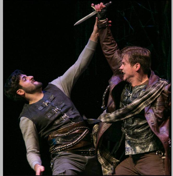
Macbeth and Macduff battle in the 2015 touring production of MACBETH .