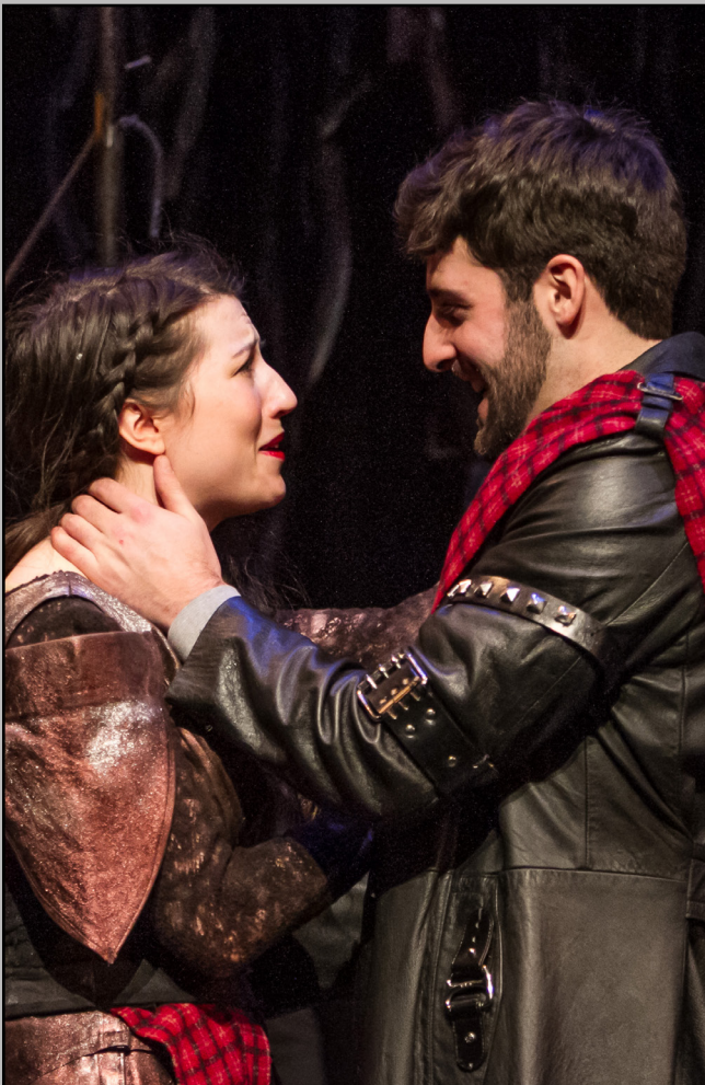
Macbeth and Lady Macbeth from the 2015 touring production of MACBETH

“It is certainly indicative that there are only two plays in which the word ‘love’ occurs so seldom as in Macbeth , and no play in which ‘fear’ occurs so often; indeed, it occurs twice or thrice as often as in most other plays”