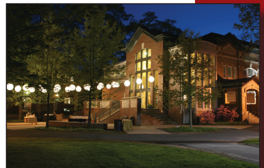
The Shakespeare Theatre of New Jersey's Main Stage