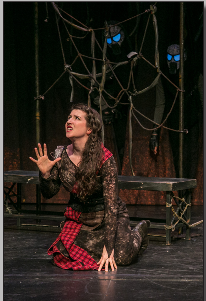
Lady Macbeth and the Witches from the 2015 touring production of MACBETH

On the eve of the great battle, Macbeth is told that Lady Macbeth has died. Alone, he ponders the meaning of his existence. A messenger brings him word that Birnam Wood has begun to move toward Dunsinane. Determined to beat the fate the witches said awaited him, he goes to battle. On the battlefield, he encounters Macduff. As Macbeth gloats that "none of woman born" can harm him, Macduff tells him that he was not born of woman, but rather had been delivered via caesarian-section. They fight and Macbeth is killed. Malcolm is crowned the new and rightful King of Scotland.