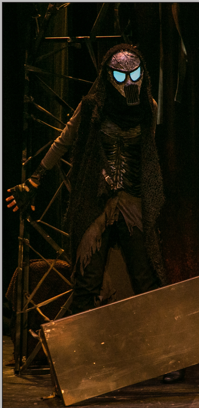
One of the Witches from the 2015 touring production of MACBETH

ownership of the restaurant. Macbeth continues to be a staple of theatres around the world, and the roles of Macbeth and Lady Macbeth remain among the most prestigious and coveted for actors.