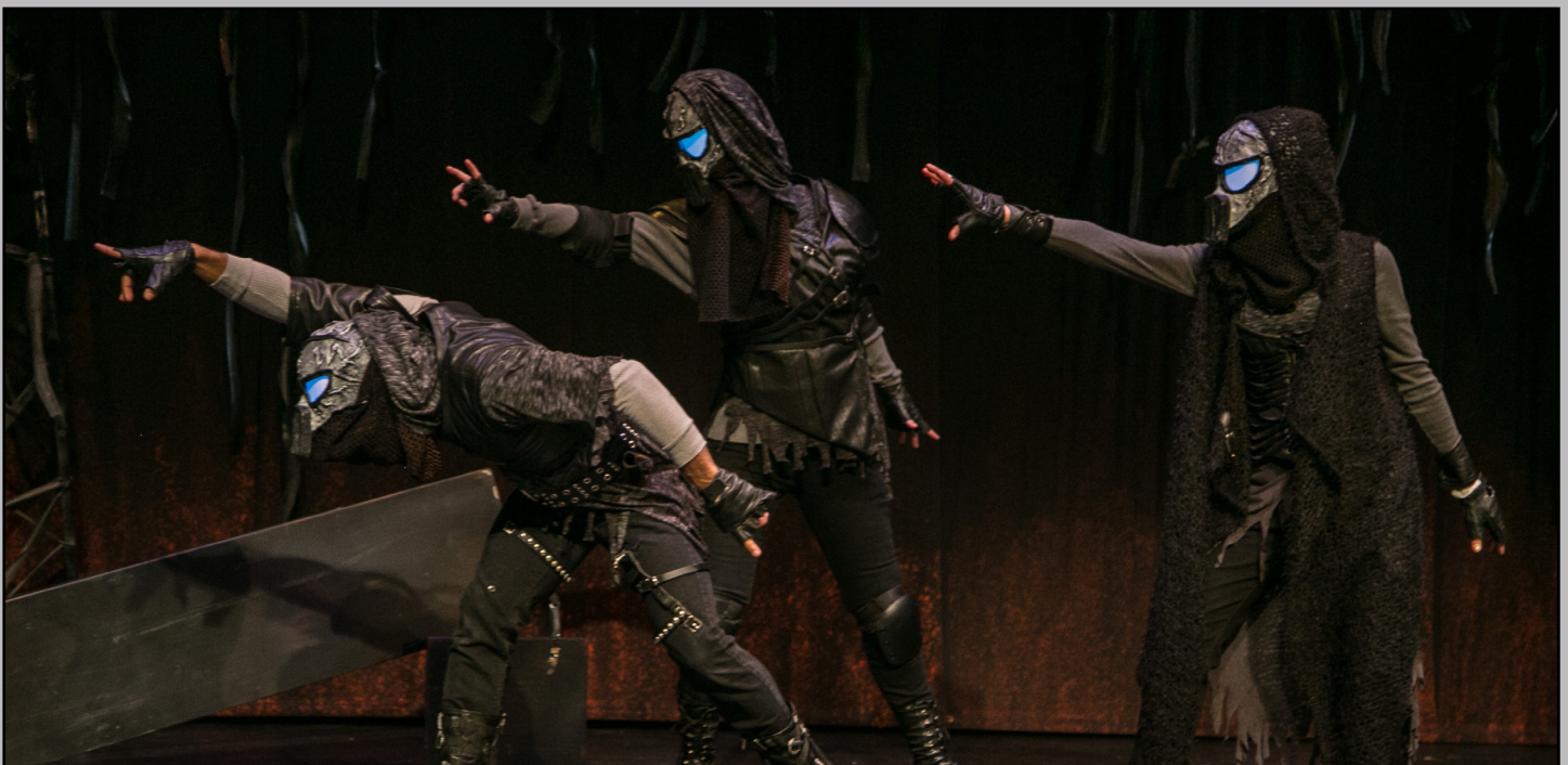
The Weird Sisters from the 2015 touring production of MACBETH