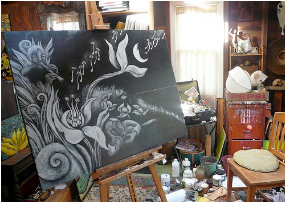
Developing grisaille by Deva Luna