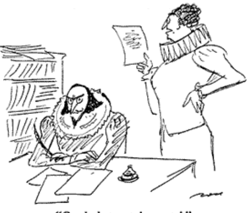
"Good, but not immortal."

11. Don't worry about puns, double-entendres, hidden meaning or anything else other than what is happening (the action) and what the characters are saving. If the other stuff comes to you – fine. Literal before figurative (of course).